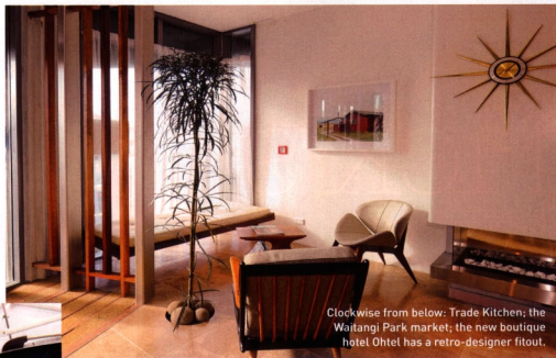
Clockwise from below: Trade Kitchen; the Waitangi Park market; the new boutique hotel Ohtel has a retro-designer fitout.