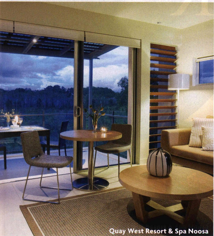
Quay West Resort &amp; Spa Noosa

A Georgian manor house set in 97ha of picturesque Berkshire parkland has been transformed into a five-star eco-spa retreat. Coworth Park, part of the Dorchester Collection, offers 70 guestrooms and suites, each with its own quintessentially British character – understated and elegant. Coworth boasts an on-site equestrian centre with polo fields and stables for more than 30 horses; as well as the UK's first carbon-neutral spa. Its bars and restaurants serve modern fare under the expert eye of celebrated chef John Campbell. From £235 ($410).